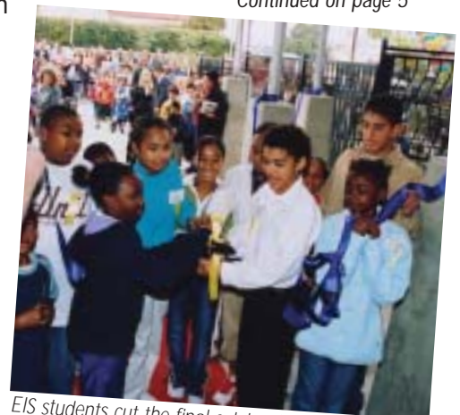
EIS students cut the final celebration ribbon, opening their new state-of-the-art science center.